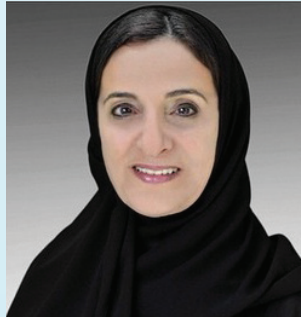
Lubna Al Qasimi